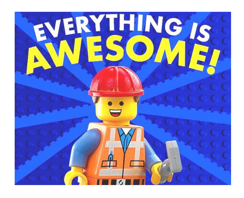
(Tiffany loved this quote and wanted to put it in vinyl on the wall!)