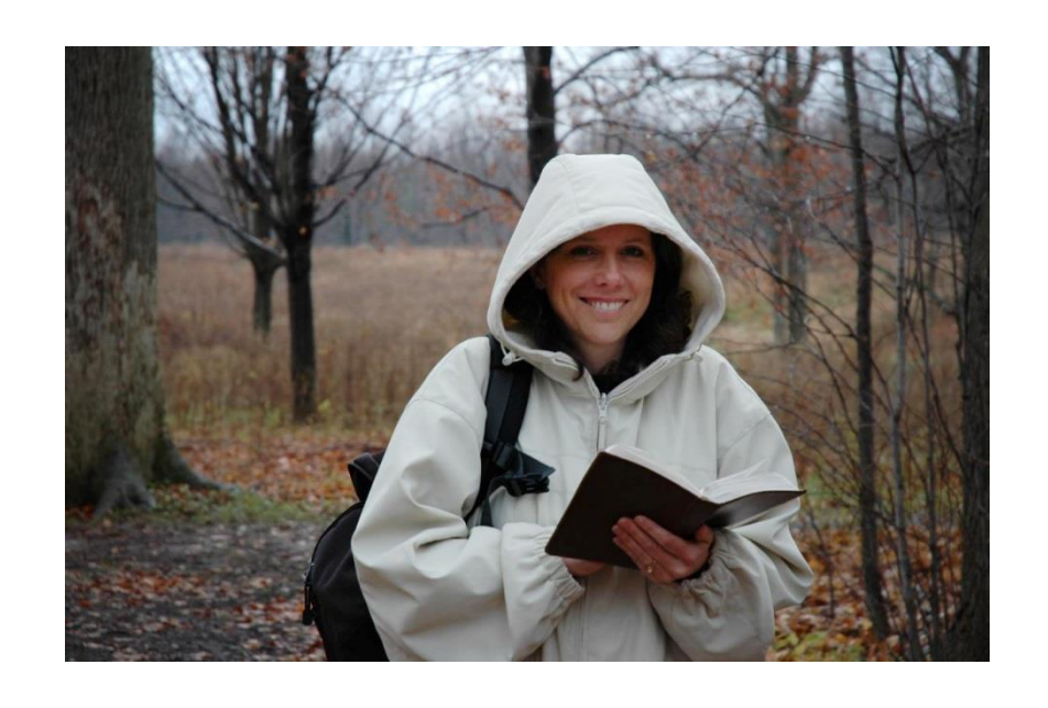
l feel its power [the Book of Mormon] each time l read.