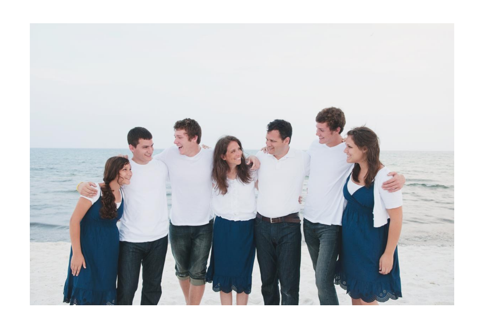
We can all be forever families if we live up to our temple covenants and endure to the end faithfully.