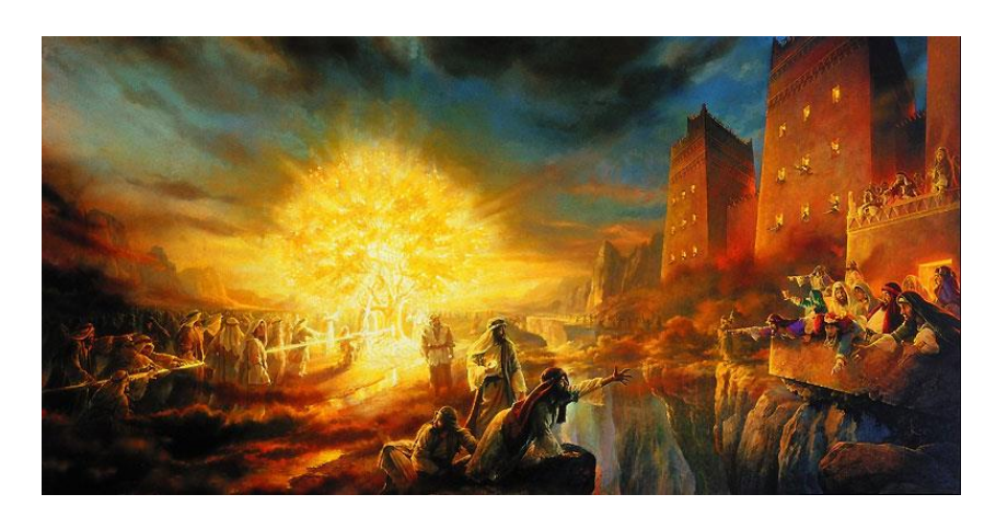
The gospel is true, it is the rod that we must cling to in this mist of darkness!